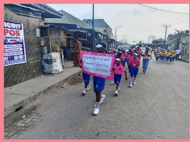
On 12 February 2024, children from the Sathya Sai School of Lagos, Nigeria, walked through their villages carrying colourful placards and singing values songs.