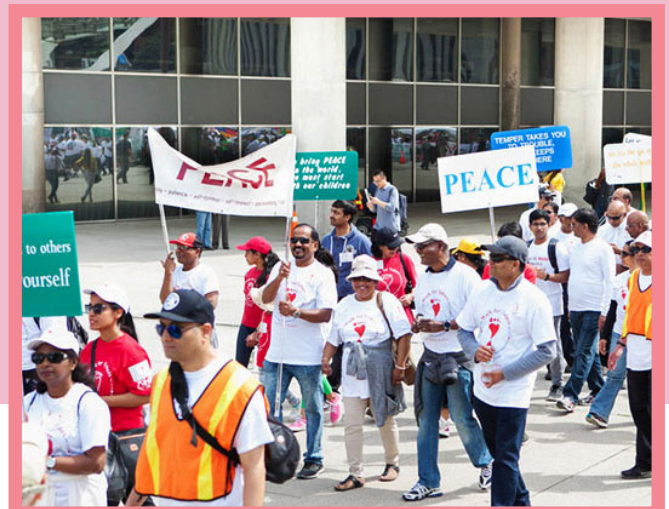
On 24 April 2024, like every year, students at the Sathya Sai School of Toronto, Canada, walked for Values. Prior to the event they did a self-assessment to determine the value they needed to practice for personal growth and made a pledge to do so during the year.

You can find out more at: https://walkforvalues.com