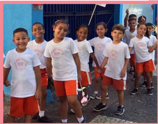
On 23 April 2023, children from the Sathya Sai School of Vila Isabel in Rio de Janeiro, Brazil, uplifted the onlookers during a rousing Walk for Values in their neighborhood!