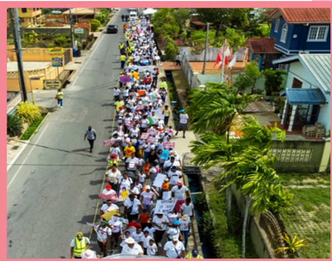
On May 6, 2023, five Sathya Sai Schools in Trinidad and Tobago organized their first Walk for Values and Environmental Fair. The theme of the event in which over 350 people took part was "Building Communities of Character, One Step at a Time".