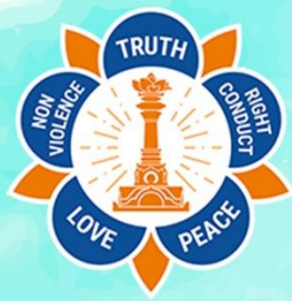
ARTWORK BY SSEHV STUDENTS, SPAIN

Art Joy family listening Love music laughter hugs hope goodness smiles Care happiness Positivity help beauty sharing human values appreciation gratitude respect silence Dedication open hearts light forgiveness learning charity friendship motivation teamwork discipline harmony nature solidarity enthusiasm fairness honesty observation relaxation Support generosity Communication inspiration personal example tolerance Wisdom Self-control Kindness sincerity fairness education patience generosity vision Serenity unity solutions good choices hard work good intentions warmth creativity compassion meditation good manners understanding equality dialogue Open-mindedness Imagination inspiration passion faith effort justice trust