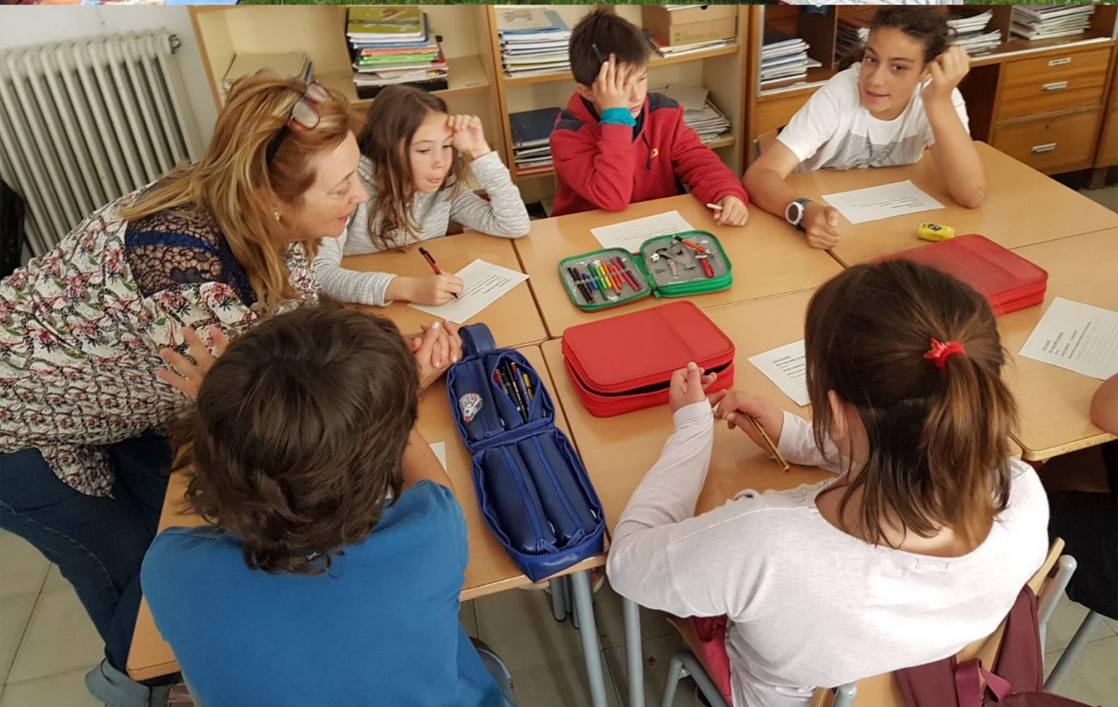
INDIVIDUAL CLASSROOM SSEHV SPAIN