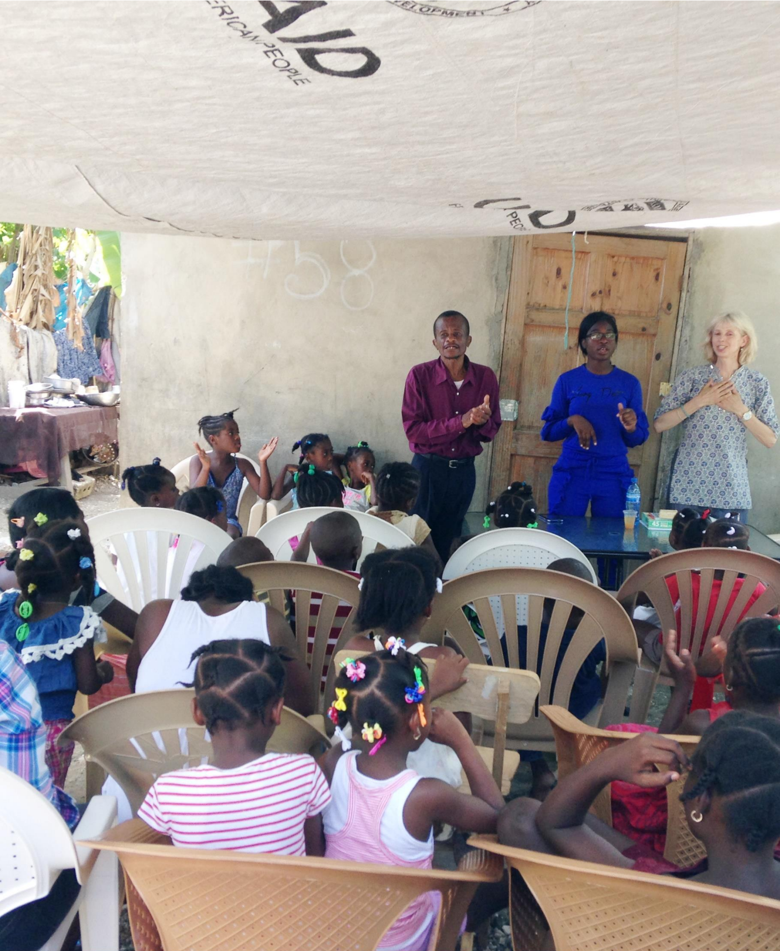
SSEHV WORKSHOP FOR YOUTH, HAITI