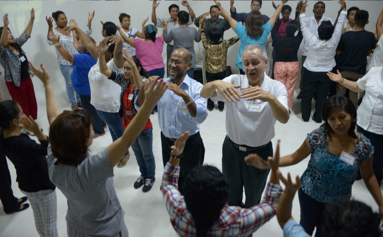
PARENTING WORKSHOP, SSEHV ECUADOR