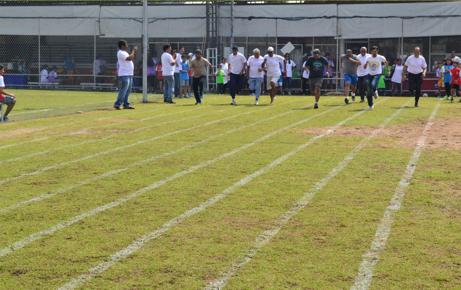
ADULTS RACE, SSEHV THAILAND