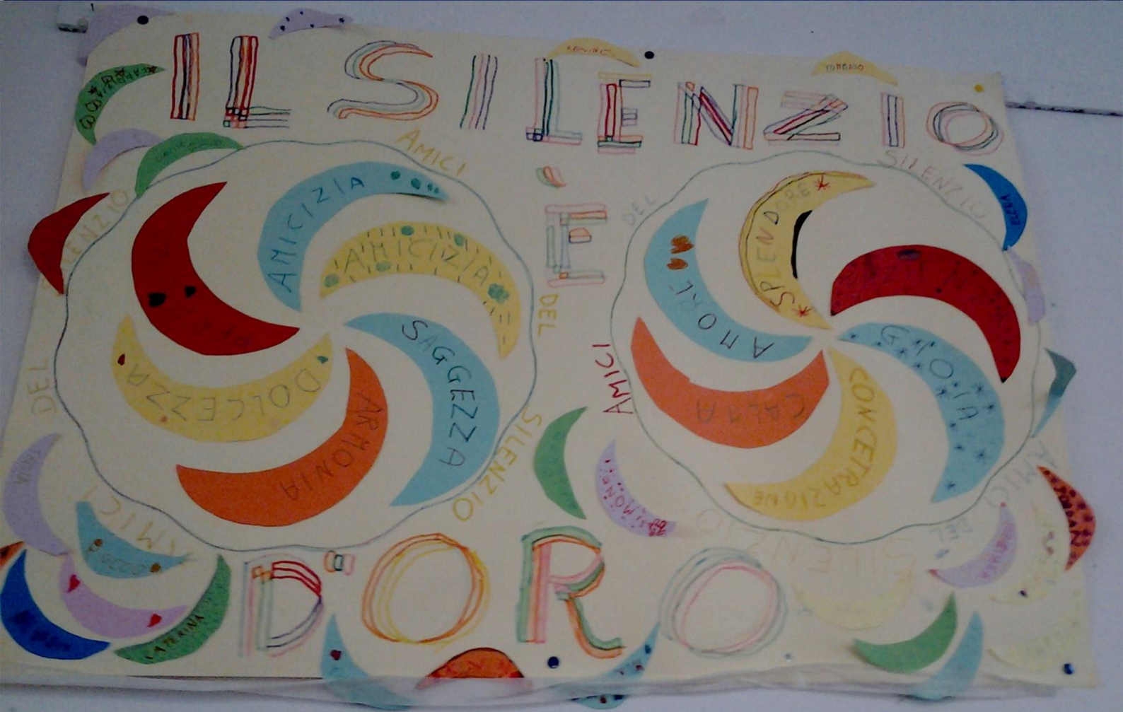
ARTWORK BY SSEHV CHILDREN, ITALY