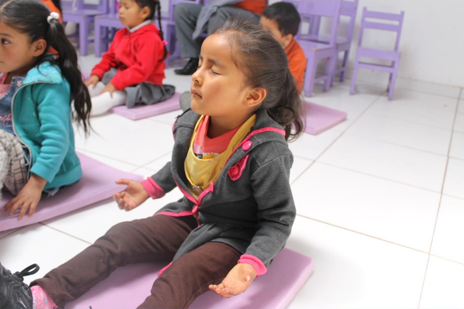
CHILDREN IN MEDITATION, SSEHV PERU