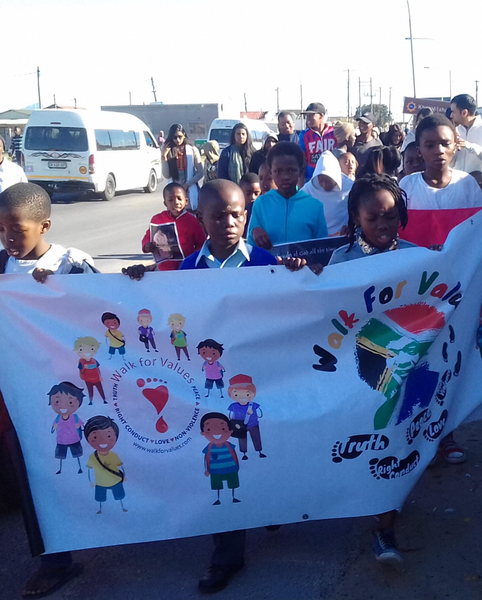
WALK FOR VALUES THROUGH THE STREETS OF KHAYELITSHA, SSEHV SOUTH AFRICA